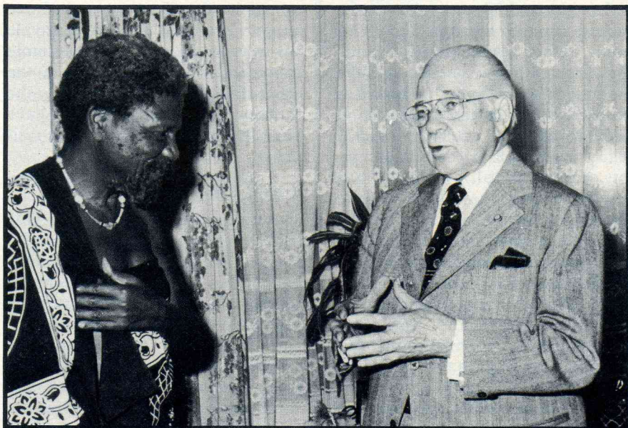
HANDSHAKE — Prime Minister Maphevu Dlamini of Swaziland greets Mr. Armstrong (above). Mr. Armstrong and King Sobhuza converse during the audience at the royal palace (left).