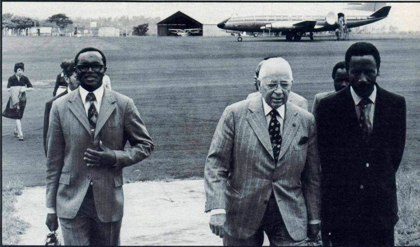
ARRIVAL — Dignitaries greet Herbert W. Armstrong at the airport in the southern African nation of Swaziland.